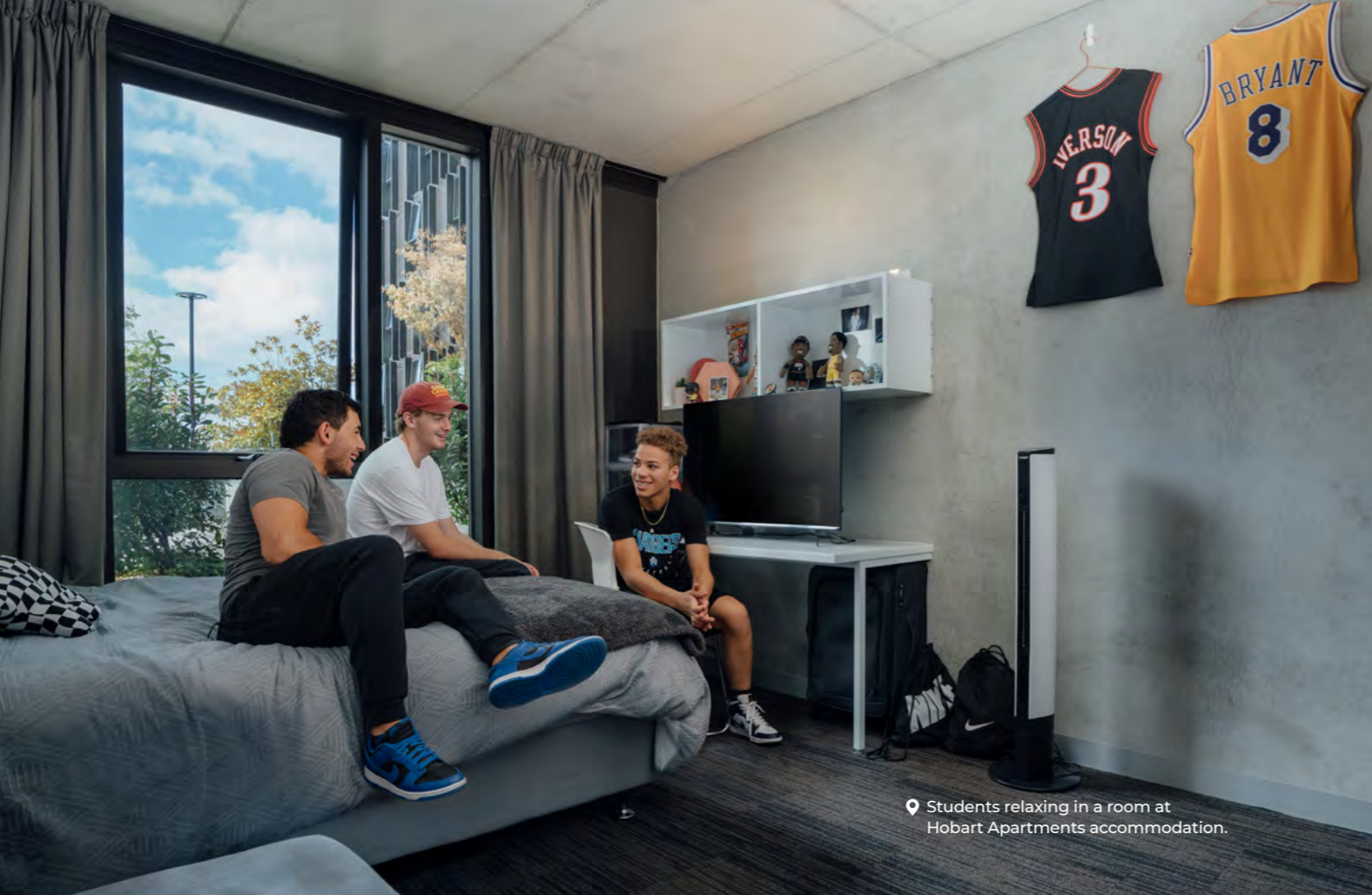
Students relaxing in a room at Hobart Apartments accommodation.