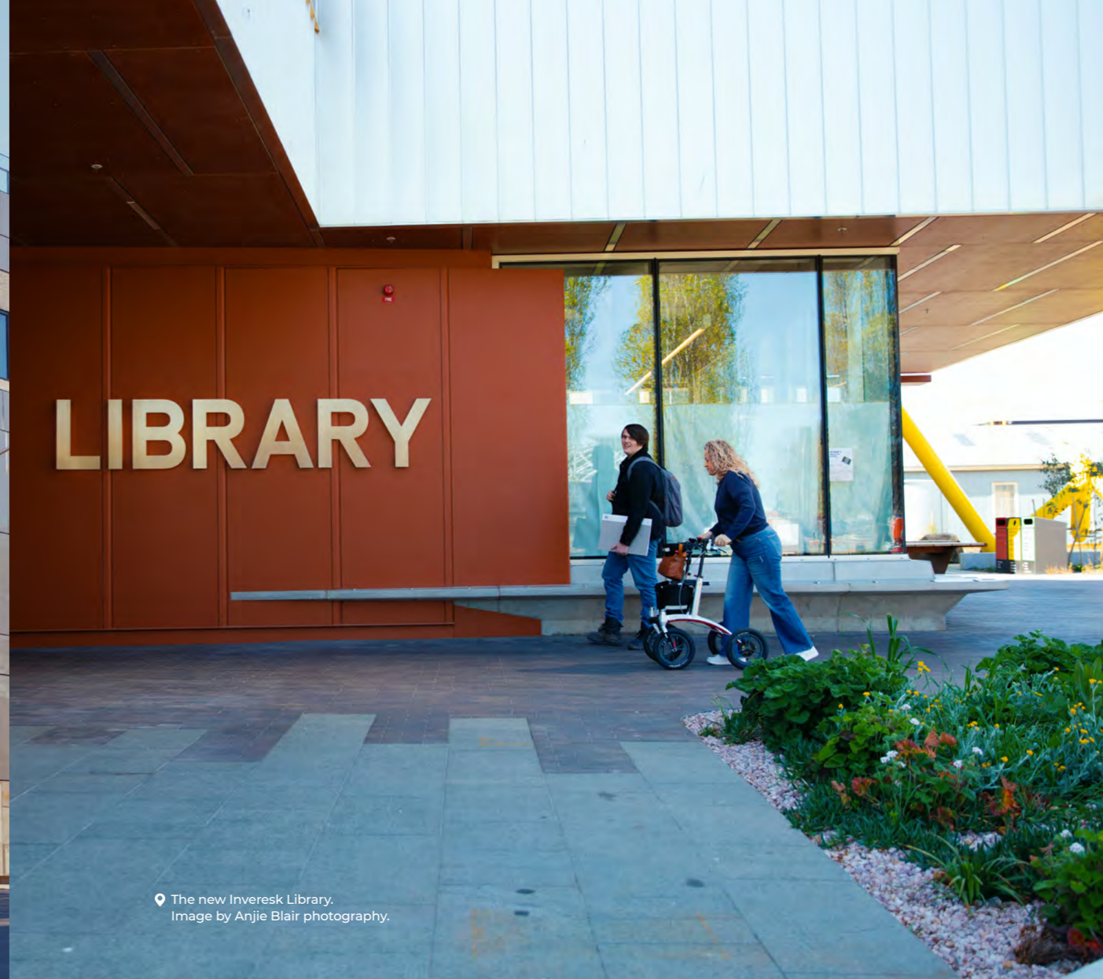
📍 The new Inveresk Library.