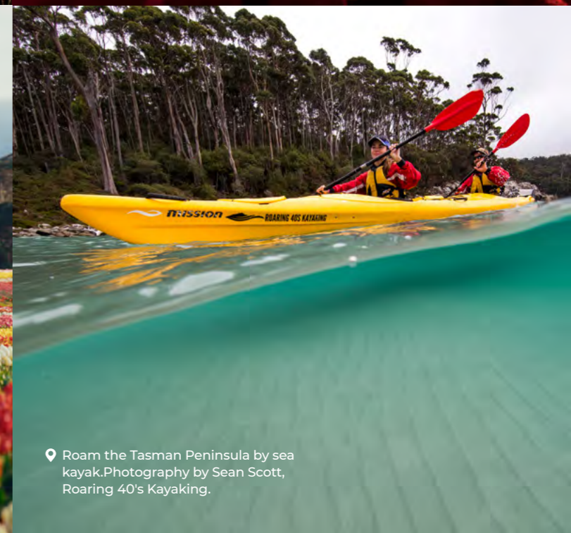
Roam the Tasman Peninsula by sea kayak.