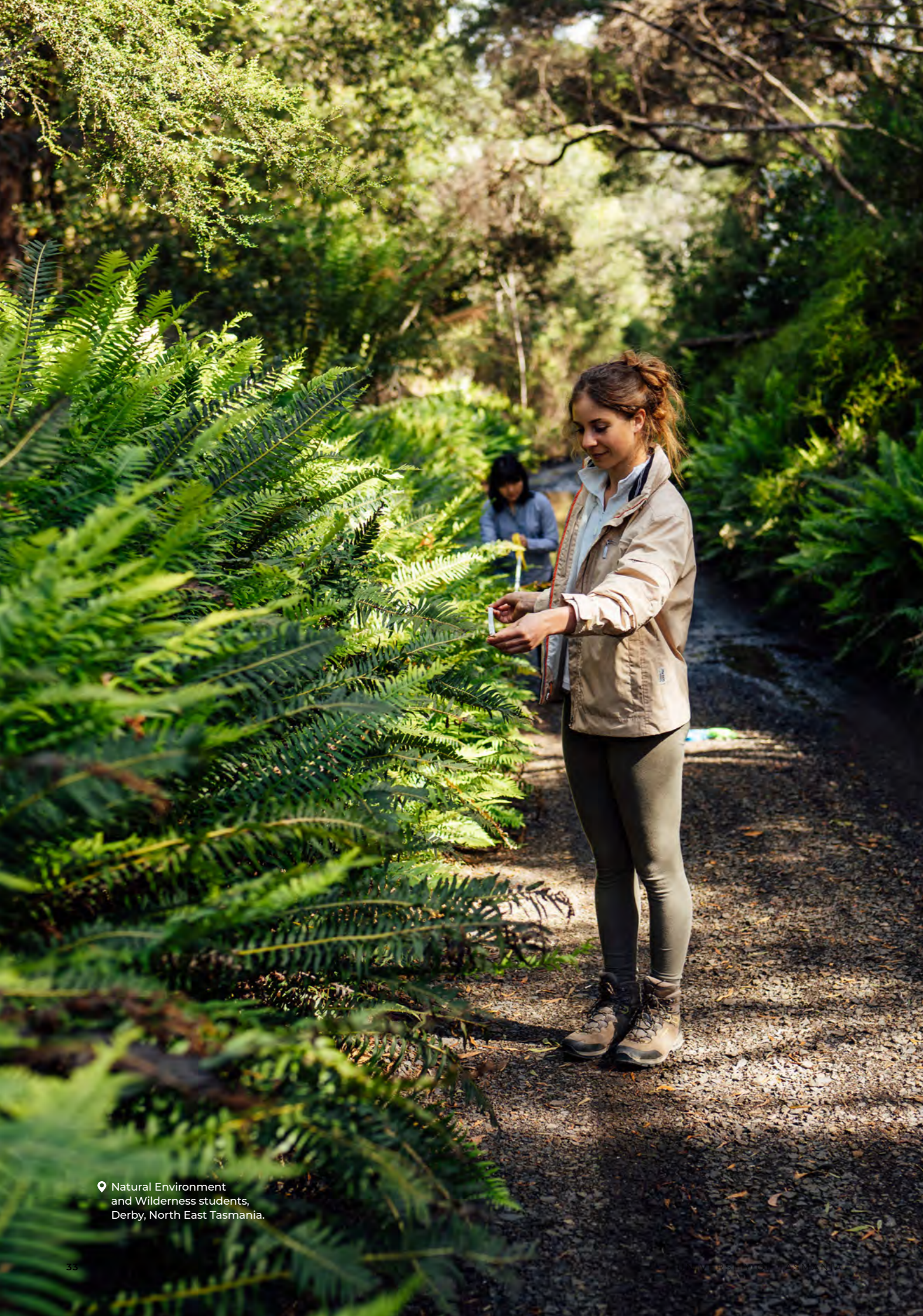
📍 Natural Environment and Wilderness students, Derby, North East Tasmania.