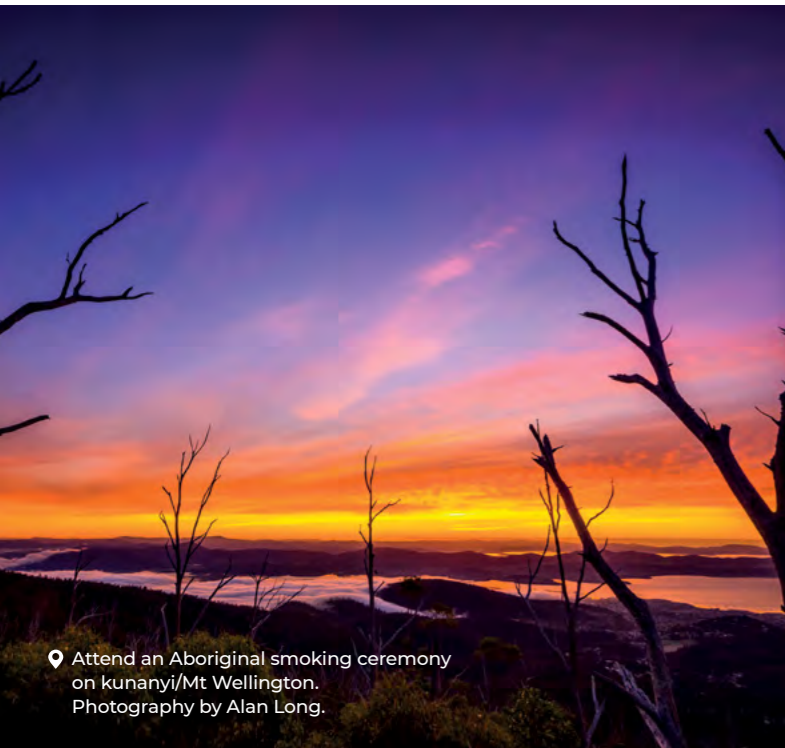
Attend an Aboriginal smoking ceremony on kunanyi/Mt Wellington.