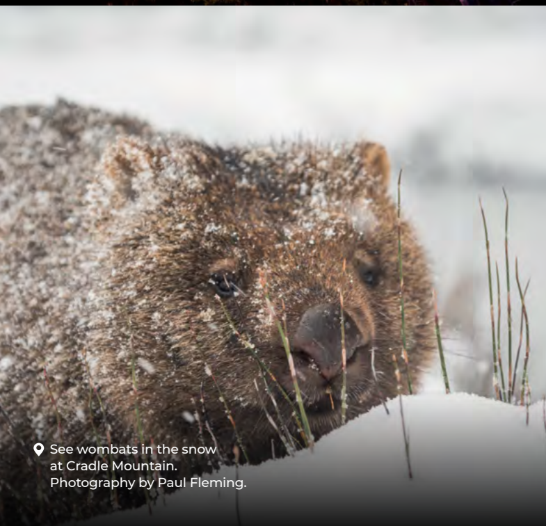
See wombats in the snow at Cradle Mountain.