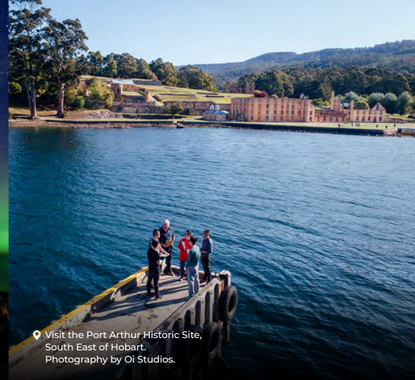
Visit the Port Arthur Historic Site, South East of Hobart.