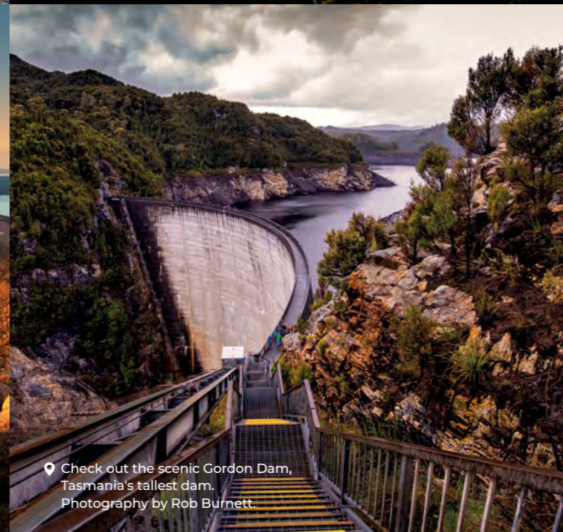
Check out the scenic Gordon Dam, Tasmania's tallest dam.