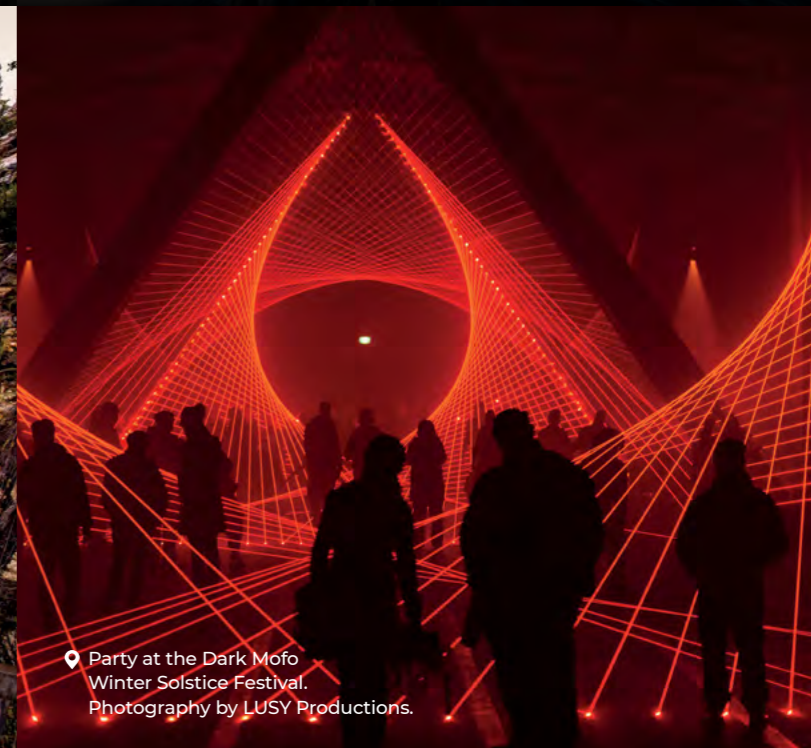
Party at the Dark Mofo Winter Solstice Festival.