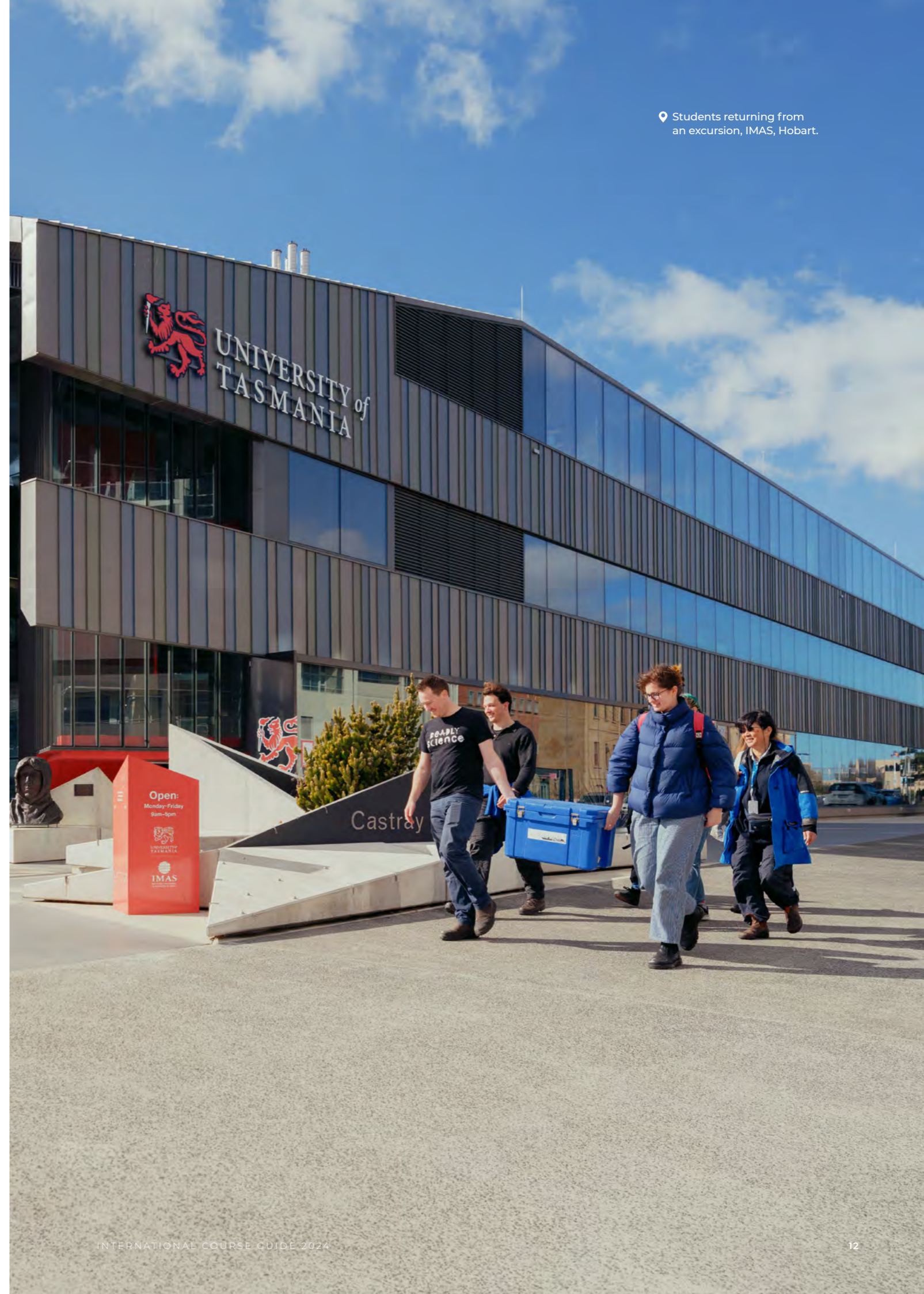
Students returning from an excursion, IMAS, Hobart.

Did you know? Tasmania is the southernmost state in Australia. From here, it's easy to travel to other major cities on the mainland or to find connections to international flights.