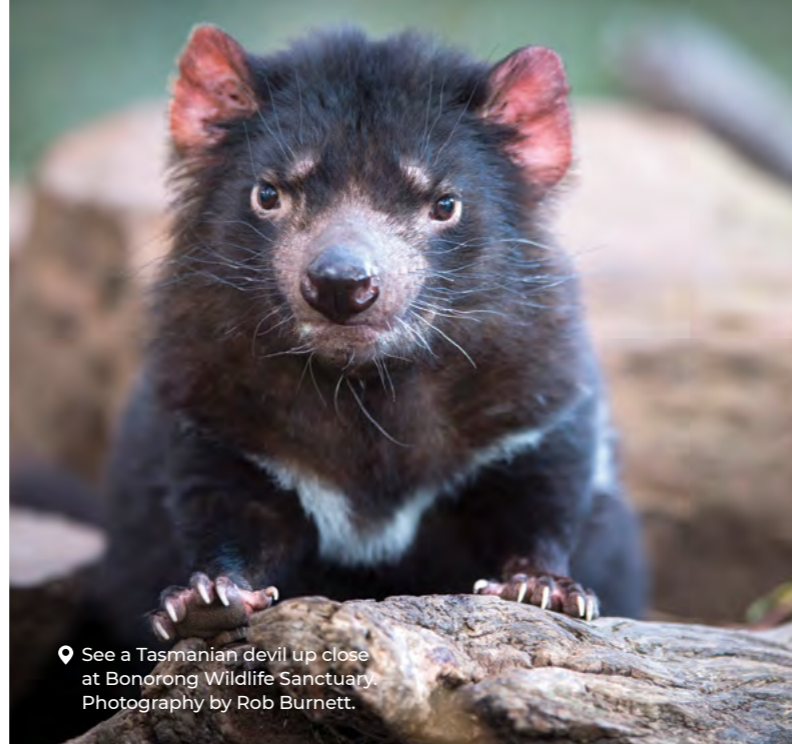
See a Tasmanian devil up close at Bonorong Wildlife Sanctuary.

Here are just a few of the amazing experiences you can have during your time in Tassie.