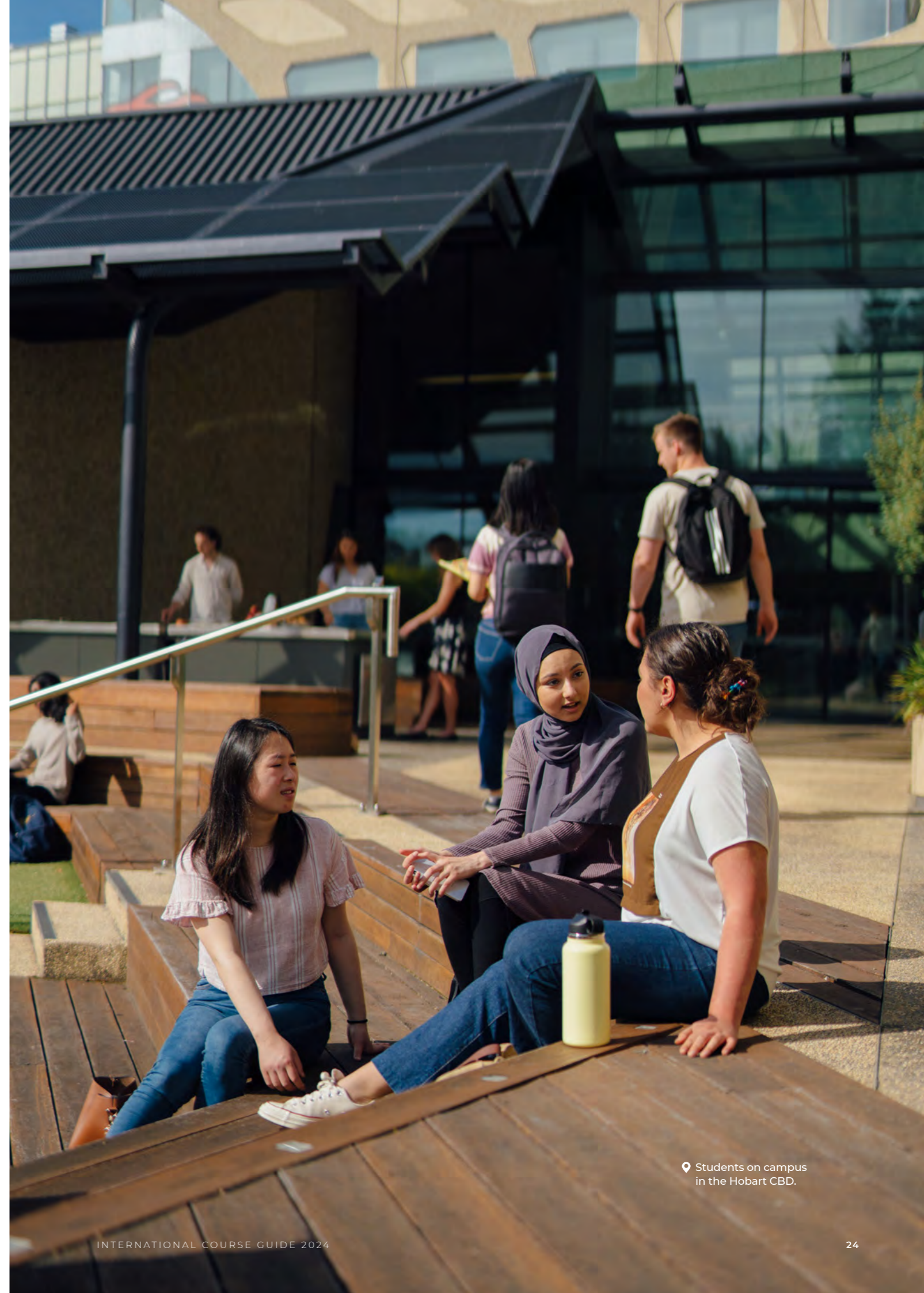
📍 Students on campus in the Hobart CBD.

*This example is based on student scholarship experiences. No identification with actual persons should be inferred.