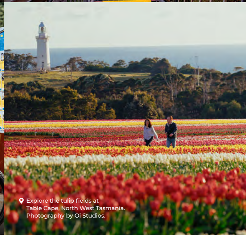
Explore the tulip fields at Table Cape, North West Tasmania.