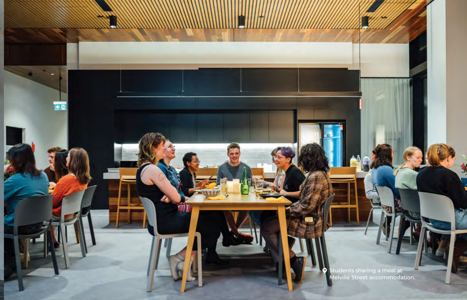
Students sharing a meal at Melville Street accommodation.