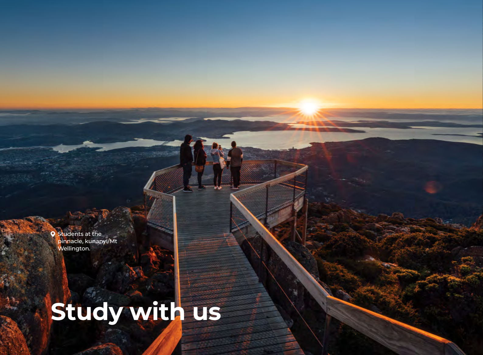
📍 Students at the pinnacle, kunanyi/Mt Wellington.