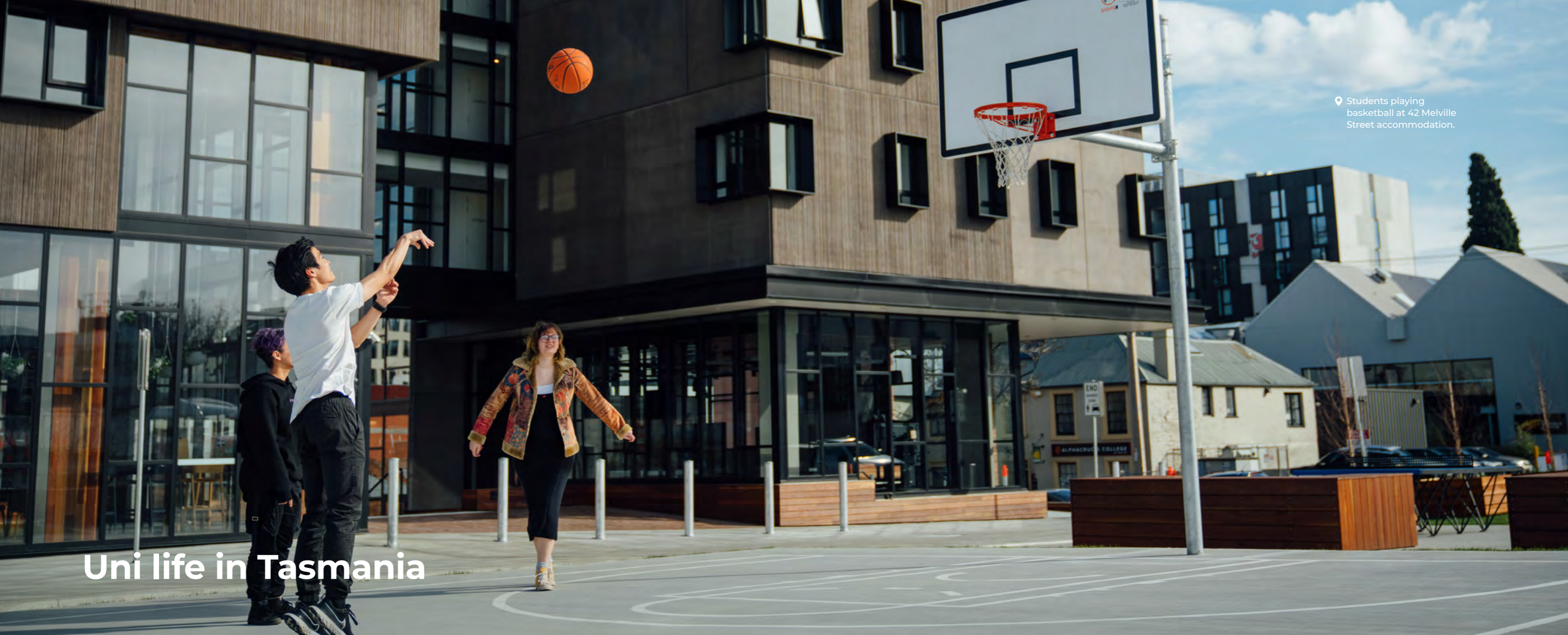
Students playing basketball at 42 Melville Street accommodation.