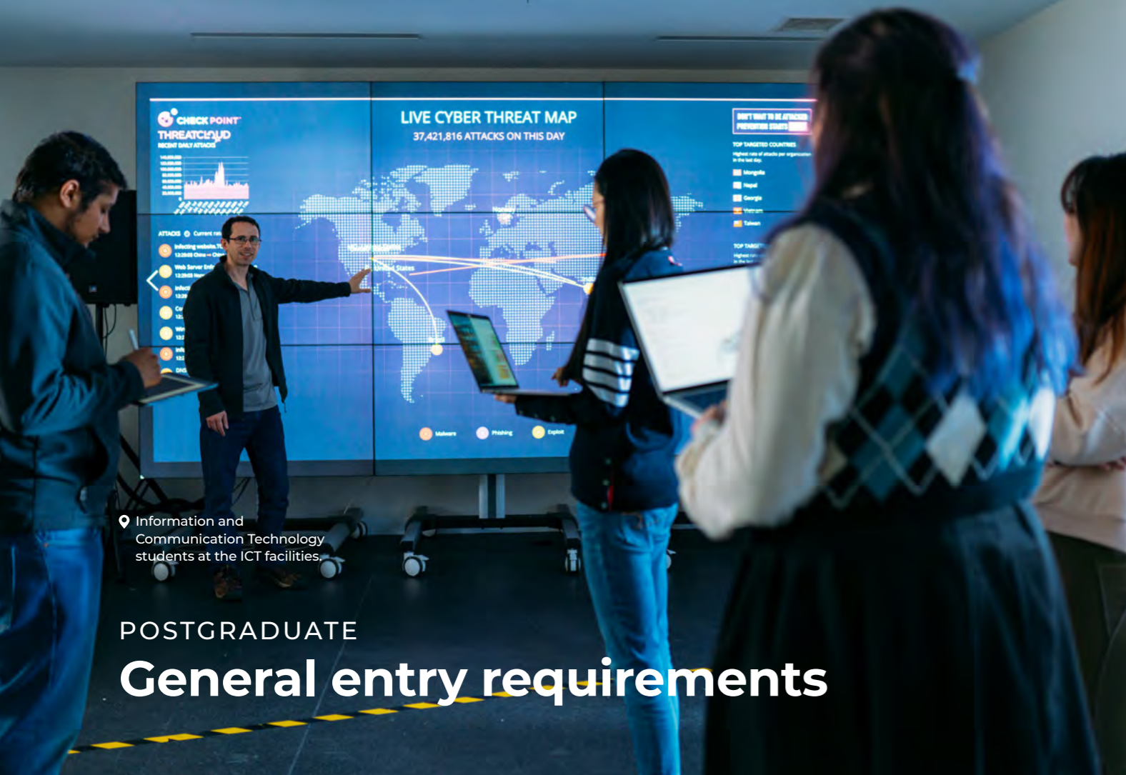
Information and Communication Technology students at the ICT facilities.