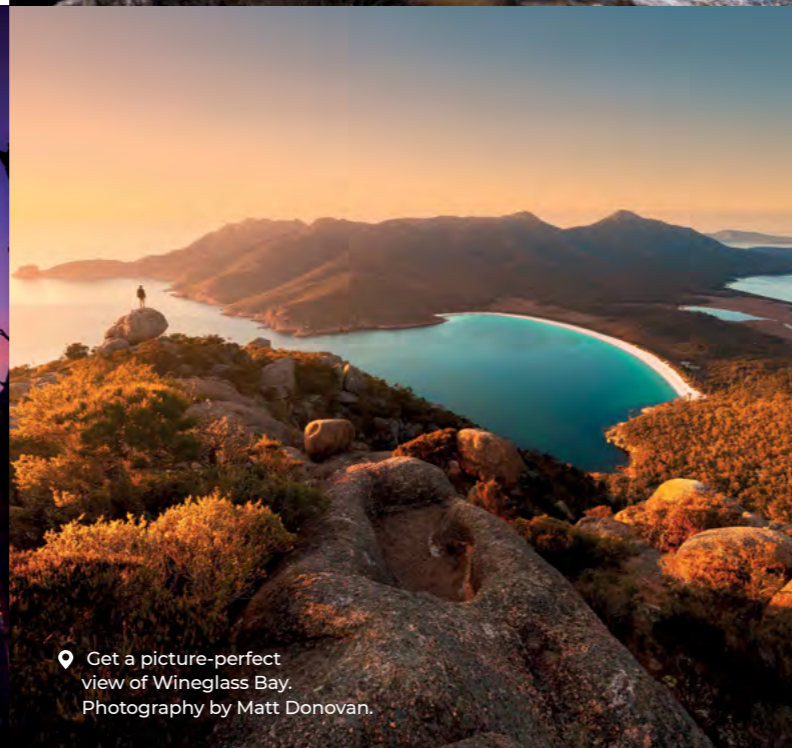
Get a picture-perfect view of Wineglass Bay.