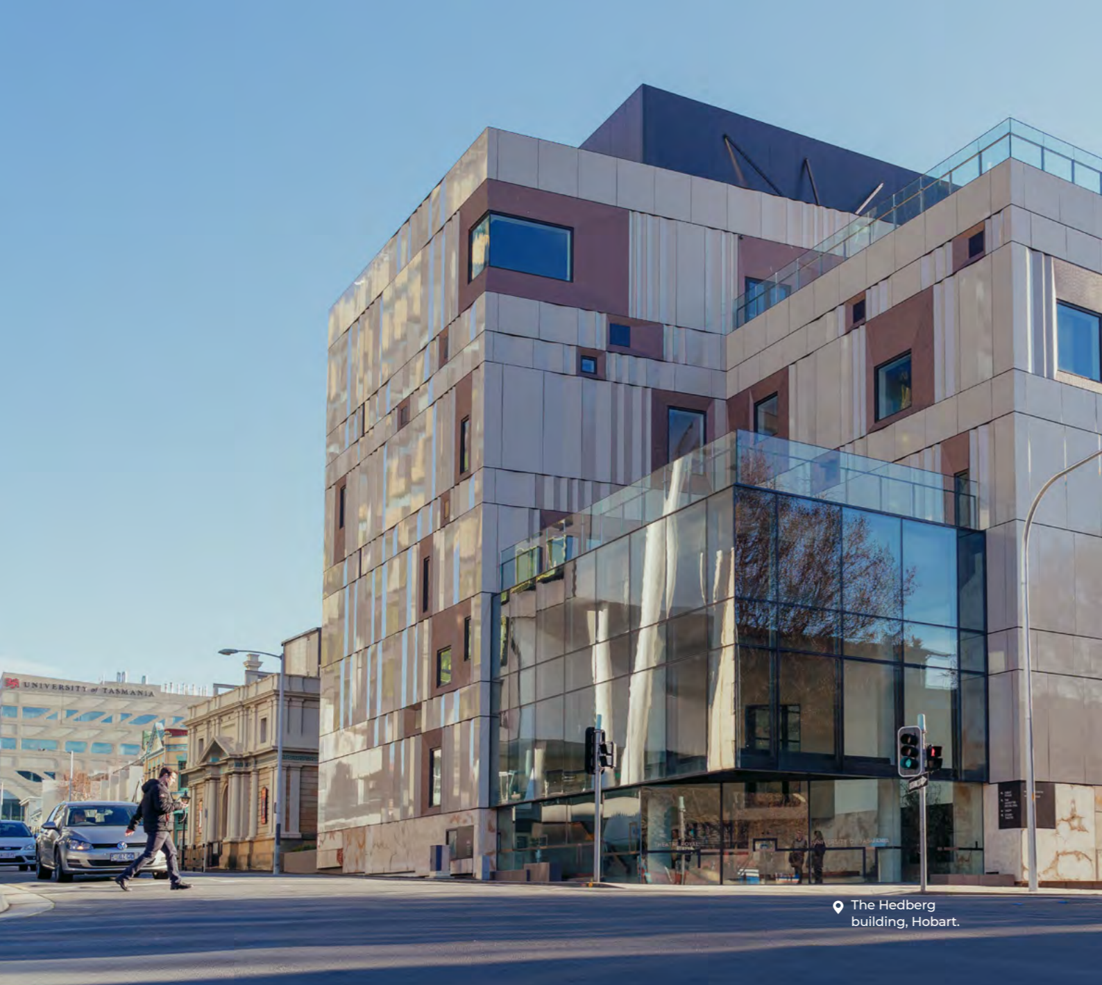
📍 The Hedberg building, Hobart.