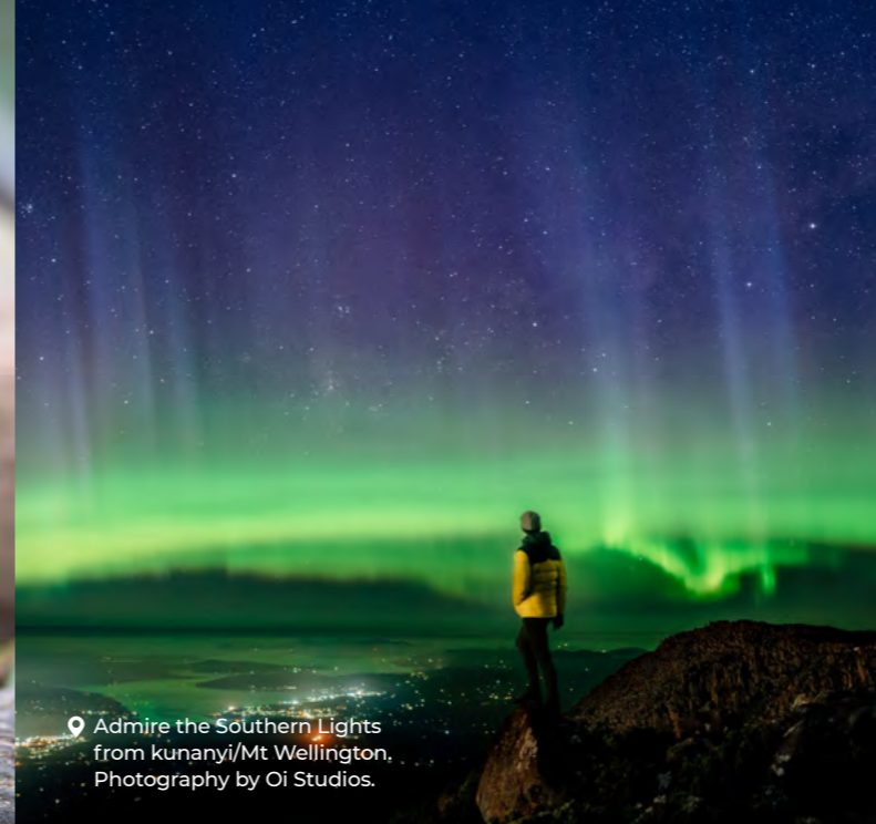
Admire the Southern Lights from kunanyi/Mt Wellington.