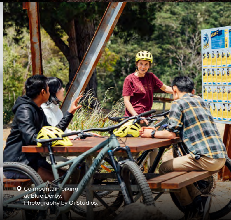
Go mountain biking at Blue Derby.