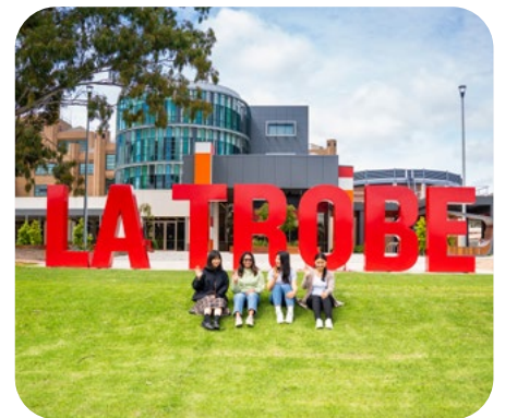
La Trobe University, Bendigo Campus