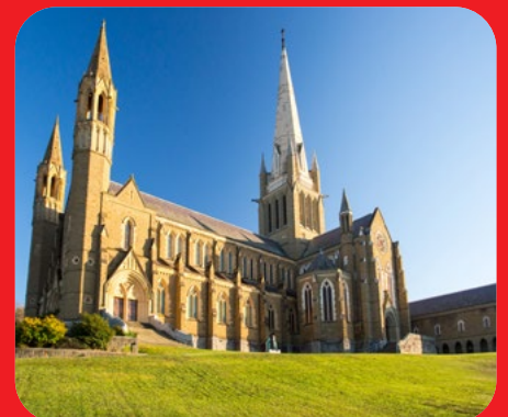
Sacred Heart Cathedral, Bendigo