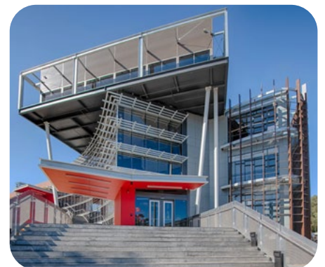
La Trobe University, Bendigo Campus