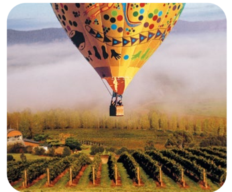
An early morning balloon ride