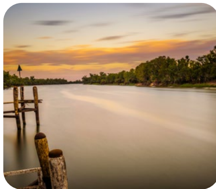
The Murray River near Mildura