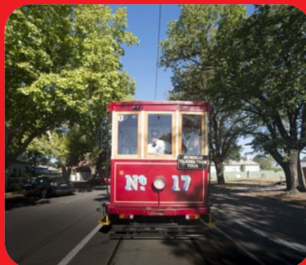
Ride aboard Bendigo's vintage tram

Bendigo is a vibrant hub in regional Victoria. Originally the epicentre of the 1850s goldrush, it is rich in Australian history and features grand, Victorian-era architecture. Bendigo also has a strong multicultural history, with one in five members of its early population emigrating from China. Now a large and modern city, it remains surrounded by native bushland. This gives it a bright yet relaxed energy and ensures a rich and focused learning experience.