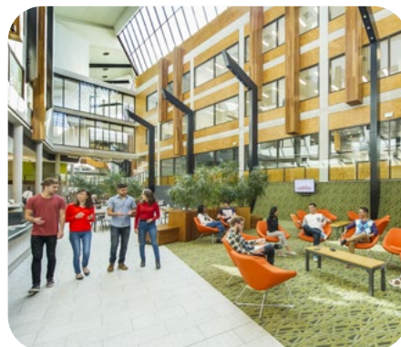
La Trobe University, Melbourne Campus (Bundoora)