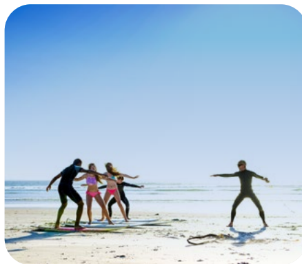
Learn to surf at one of Victoria's many beaches

Victoria's size makes it easy to explore. Rent a car, catch a train or book a tour to see the Great Ocean Road, Phillip Island, the Otways, Wilsons Promontory and wineries in the Yarra Valley. Go hiking in the You Yangs or the Grampians. Visit the historic cities of Healesville and Castlemaine, or take in the alpine wilderness of the Snowy Mountains area.