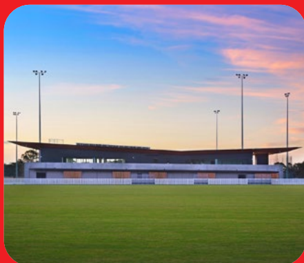
La Trobe University Sports Park

latrobe.edu.au/sport/facilities/bundoora-sports-facilities/la-trobe-sports-park