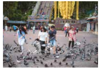
Batu Caves, Selangor