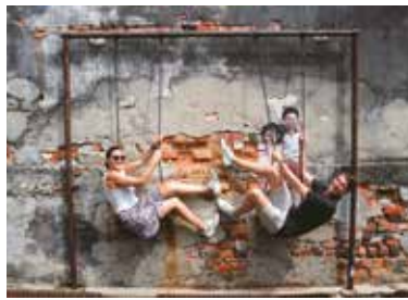
George Town, Penang