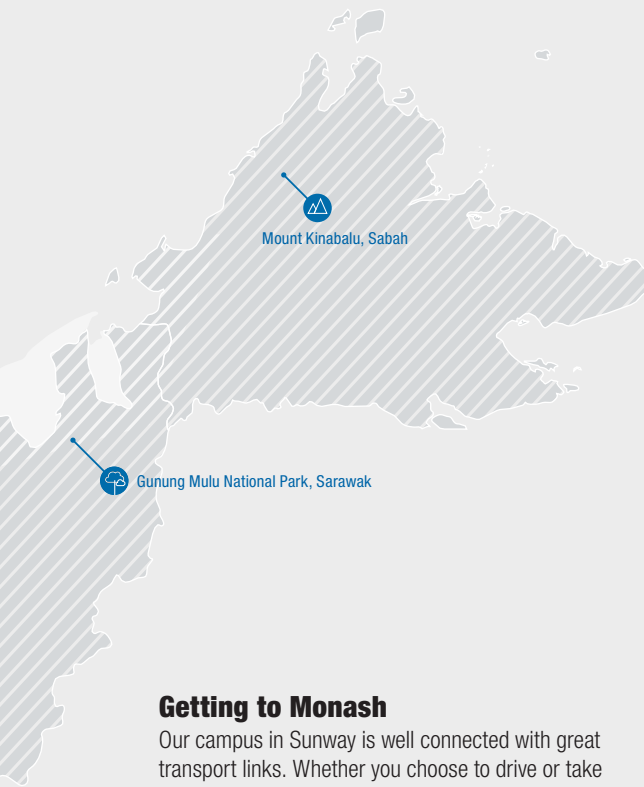
Mount Kinabalu, Sabah