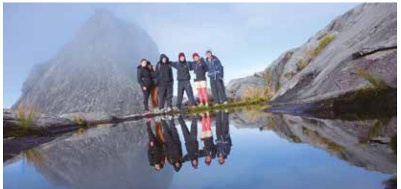
Mount Kinabalu, Sabah