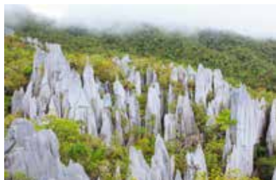
Gunung Mulu National Park, Sarawak