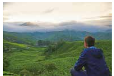
Cameron Highlands, Pahang