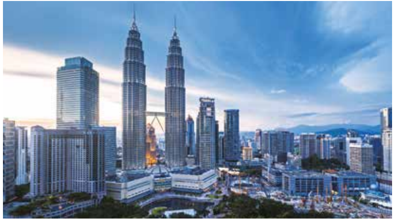
Petronas Twin Towers, Kuala Lumpur