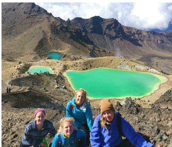
Study Abroad students at Emerald Lakes, a stunning part of Tongariro Alpine Crossing.